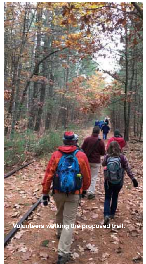
Volunteers walking the proposed trail.

Recent plans are to continue the Squannacook River Rail Trail down to the Bertozzi Wildlife Area in Groton, making it more possible that a future trail could extend to connect with the Nashua River Rail Trail.