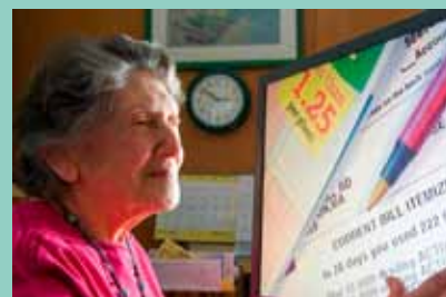
MAB Community Services, Inc.'s Nashoba Valley Visually Impaired Elders Program will help improve the health of older adults who are blind or visually impaired