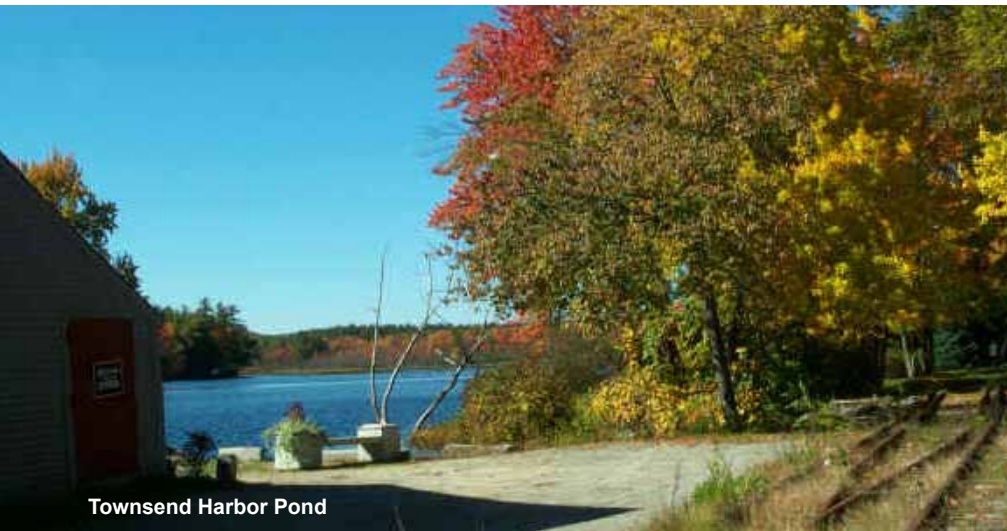
Townsend Harbor Pond

Group establishes an agency fund at the Foundation to help further its mission.