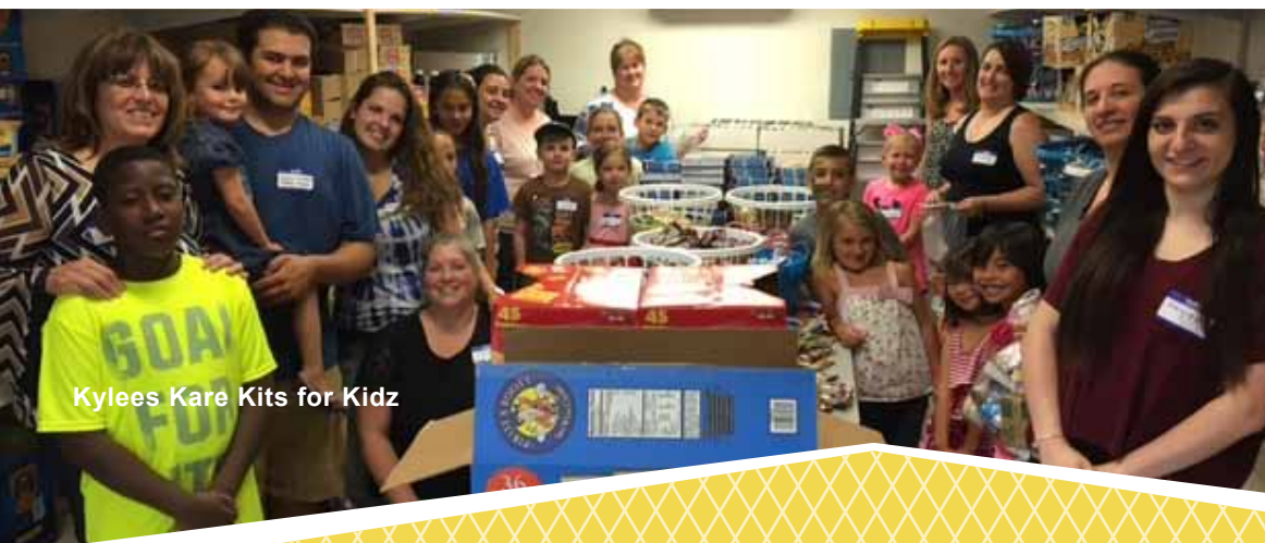
Kylees Kare Kits for Kidz

A $4,000 grant to Special Olympics Massachusetts , Marlborough, will support new uniforms and part of the cost for a training facility for the organization's activities in the region.