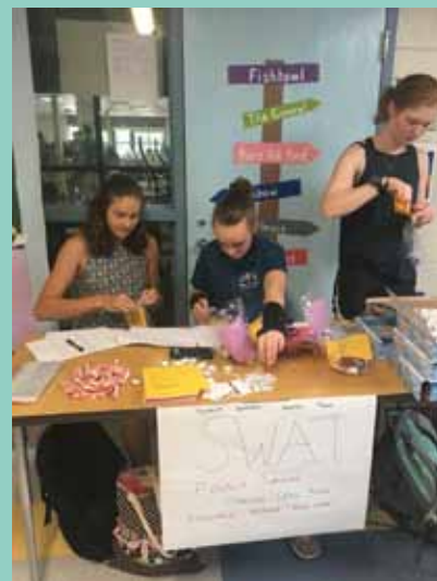
SHINE Initiative has established a Student Wellness Advisory Team (SWAT) at Bromfield school in Harvard, that empowers students to create activities and campaigns to promote student mental wellness.

Nashoba Valley Community Healthcare Fund advances the health of residents in 13 communities originally served by the previous local hospital, including Ashby, Ayer, Bolton, Dunstable, Groton, Harvard, Lancaster, Littleton, Lunenburg, Pepperell, Shirley, Townsend and Westford.