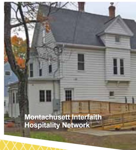
Montachusett Interfaith Hospitality Network