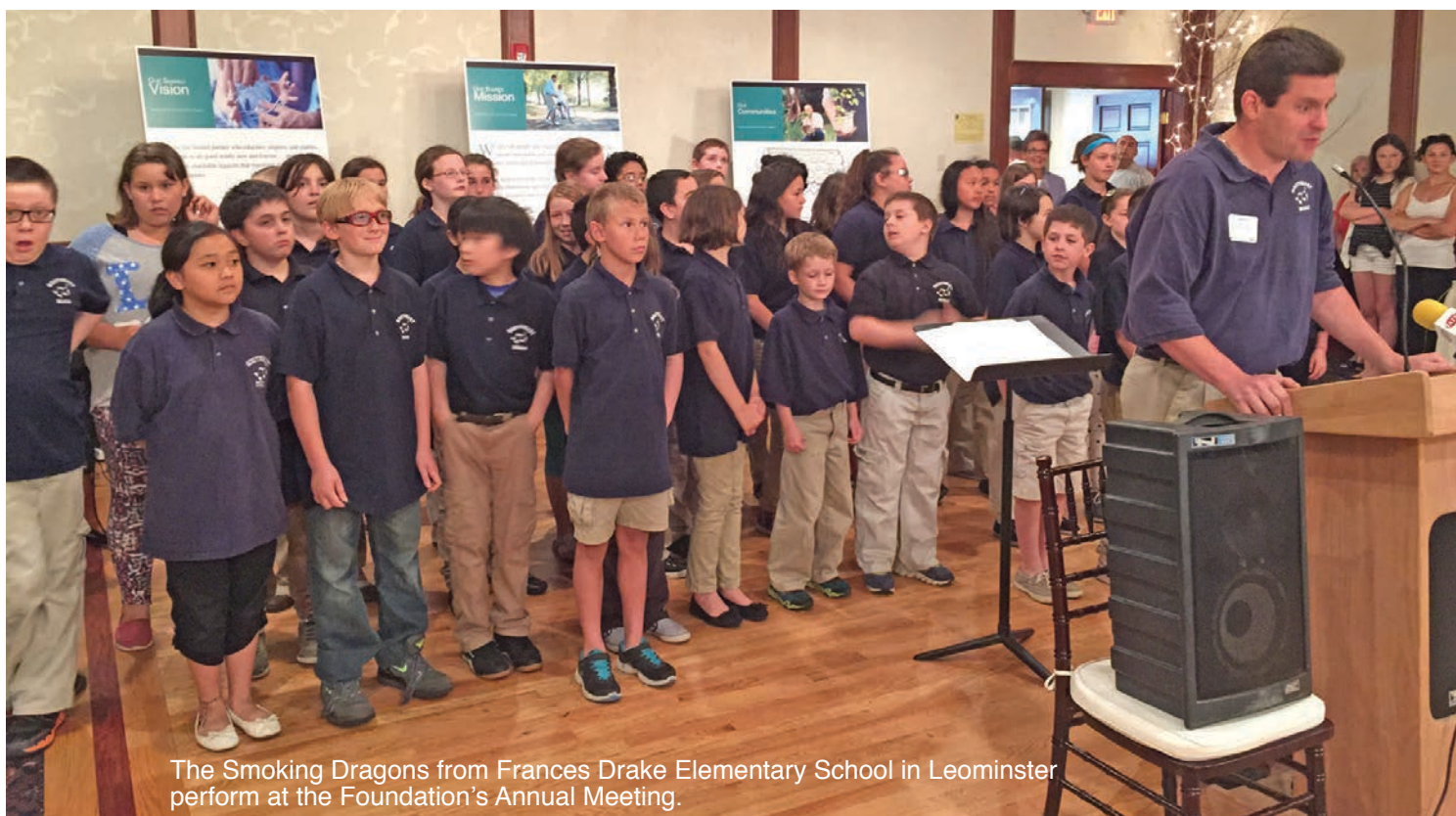
The Smoking Dragons from Frances Drake Elementary School in Leominster perform at the Foundation's Annual Meeting.