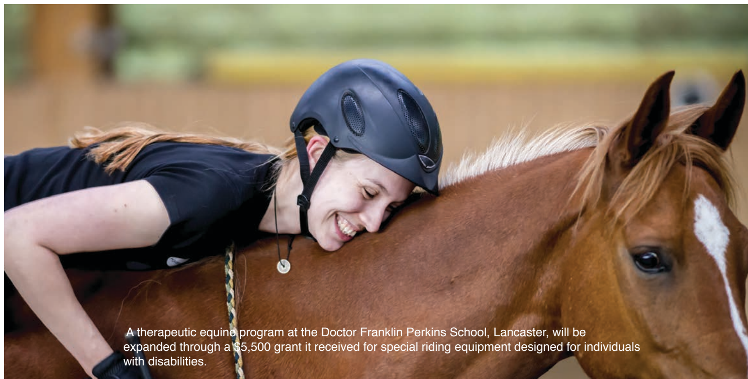
A therapeutic equine program at the Doctor Franklin Perkins School, Lancaster, will be expanded through a $5,500 grant it received for special riding equipment designed for individuals with disabilities.