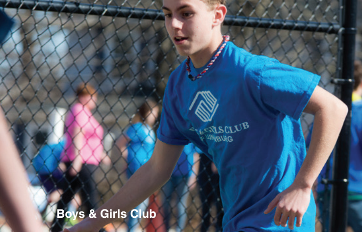
Boys & Girls Club