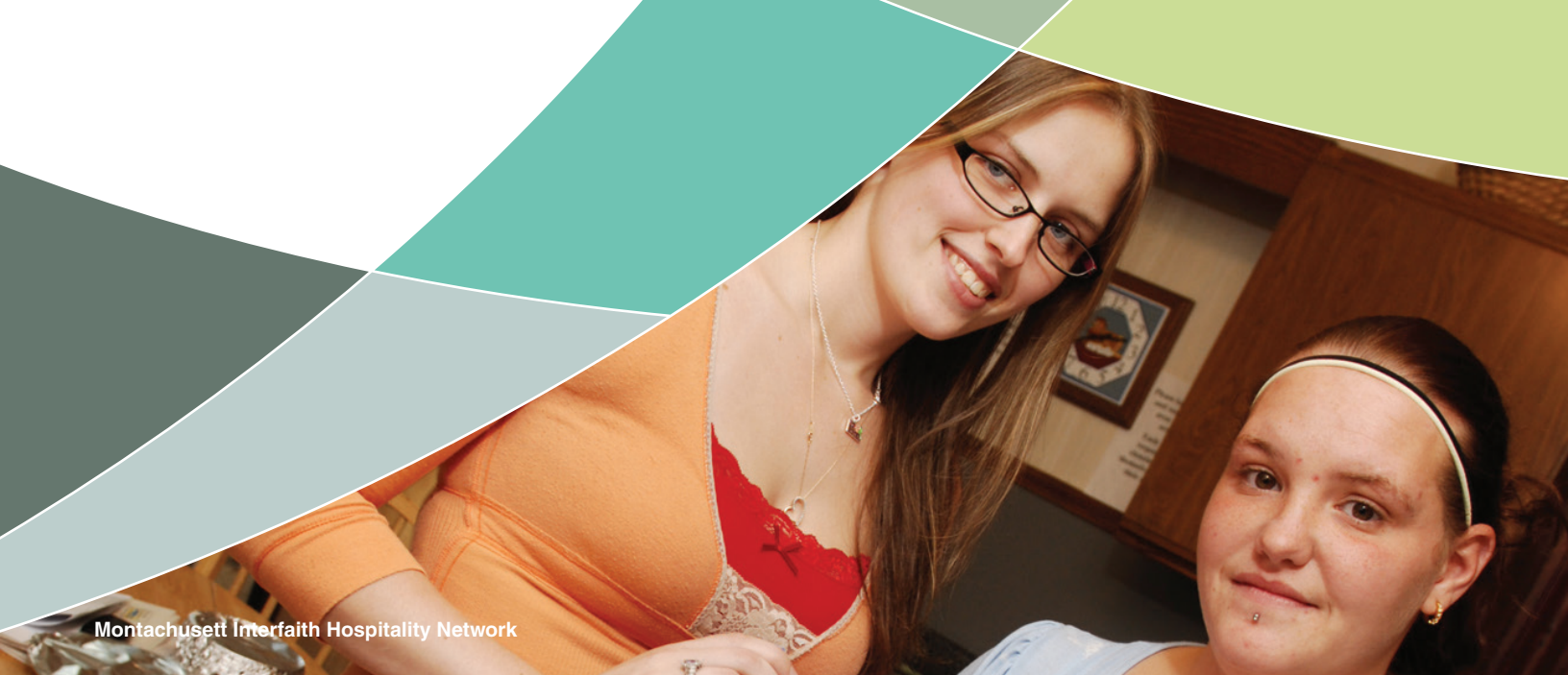
Montachusett Interfaith Hospitality Network

At-risk youth will get vocational and educational experience through The Trustees of Reservations program, Leominster Regional Youth Conservation Corps, which received a $15,000 grant.