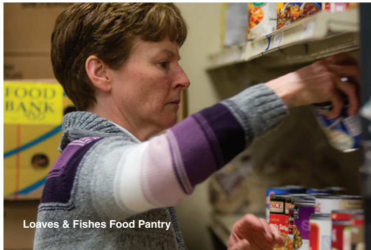
Loaves & Fishes Food Pantry