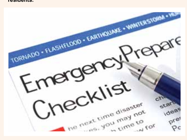
An $18,000 grant will assist L.U.K. Crisis Center, Inc., in creating documented practices for trauma preparedness among schools in the Nashoba Valley region.