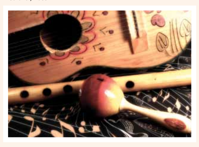
ShirleyArts! Inc. received $750 for its Ukuleles for Kids program, which provides no-cost instruments for children.