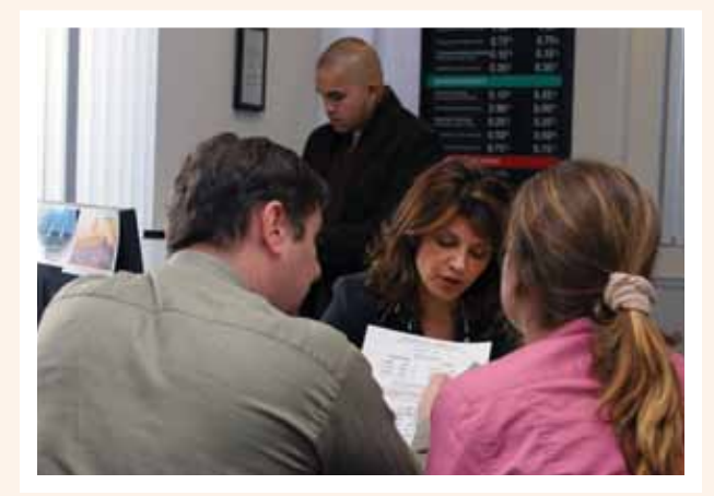
Loaves & Fishes Food Pantry, Inc., received $20,000 for its Face of Hunger program, which provides food and referral services to area residents.