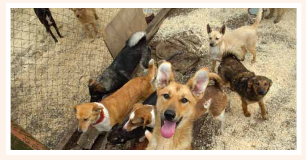
Animal Shelter Inc. received a $20,000 grant for expansion and redesign of its nonprofit no-kill animal shelter in Sterling, Mass.