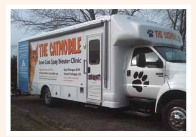
Merrimack River Feline Rescue Society received a $6,000 grant for its Catmobile, which will provide spay and neuter services for free or a reduced service fee.