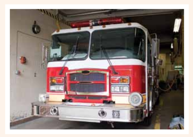
Townsend Fire-EMS received $18,000 to purchase equipment to assist in off-road rescue operations.