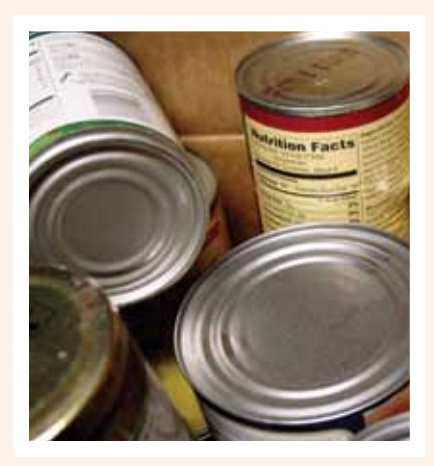
Shirley Seniors Friendship Fund's $5,000 grant will be used to provide access to food pantries for housebound seniors.