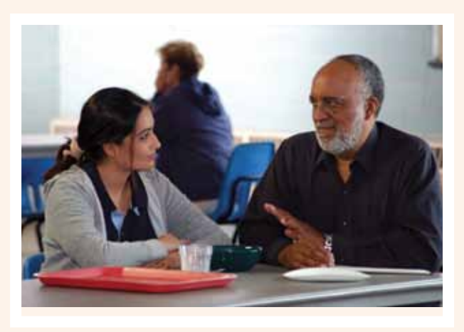
A $10,000 grant to Littleton Elder and Human Services will be used to hire a part-time person to coordinate health and wellness services for town senior citizens.