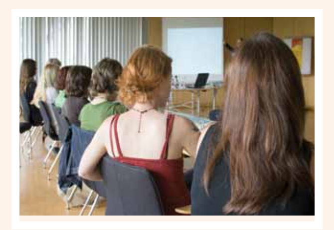
Pathways for Change, Inc.'s $12,000 grant will provide sexual violence education to area adolescents through their Sexual Assault Youth (SAYE) program.