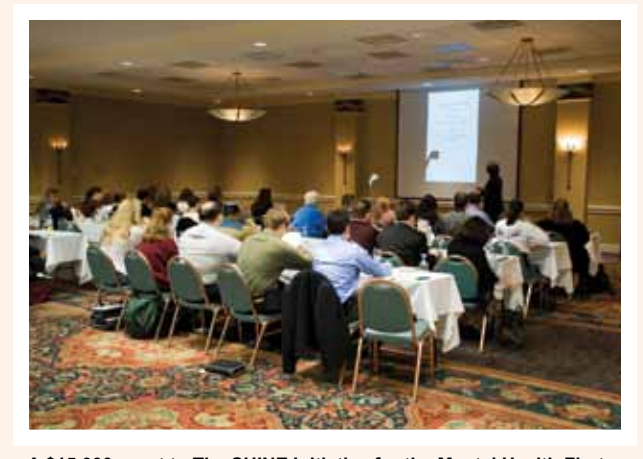
A $15,000 grant to The SHINE Initiative for the Mental Health First Aid Program will be used to train school personnel in Nashoba Valley to identify, understand and respond to signs of mental illnesses and substance use disorders.