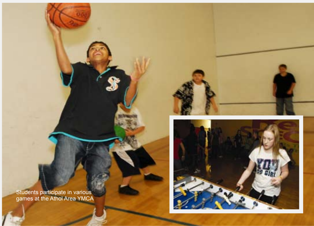
Students participate in various games at the Athol Area YMCA

THE ATHOL AREA YMCA “YOUTHREACH! AFTER SCHOOL & SUMMER PROGRAMS” received a $12,500 grant for the Foundation’s general endowment. The program reaches vulnerable young people and provides a safe, fun and nurturing environment that provides leadership development, academic support, sports, health and wellness, in addition to the arts and humanities.