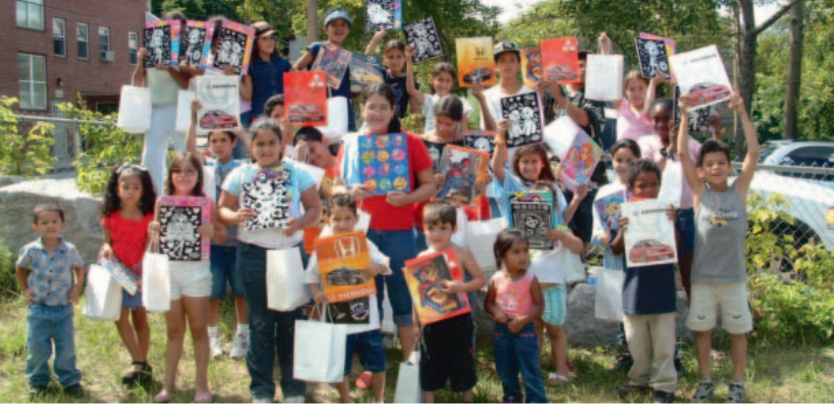
Cleahorn Neighborhood Center, Fitchburg, MA